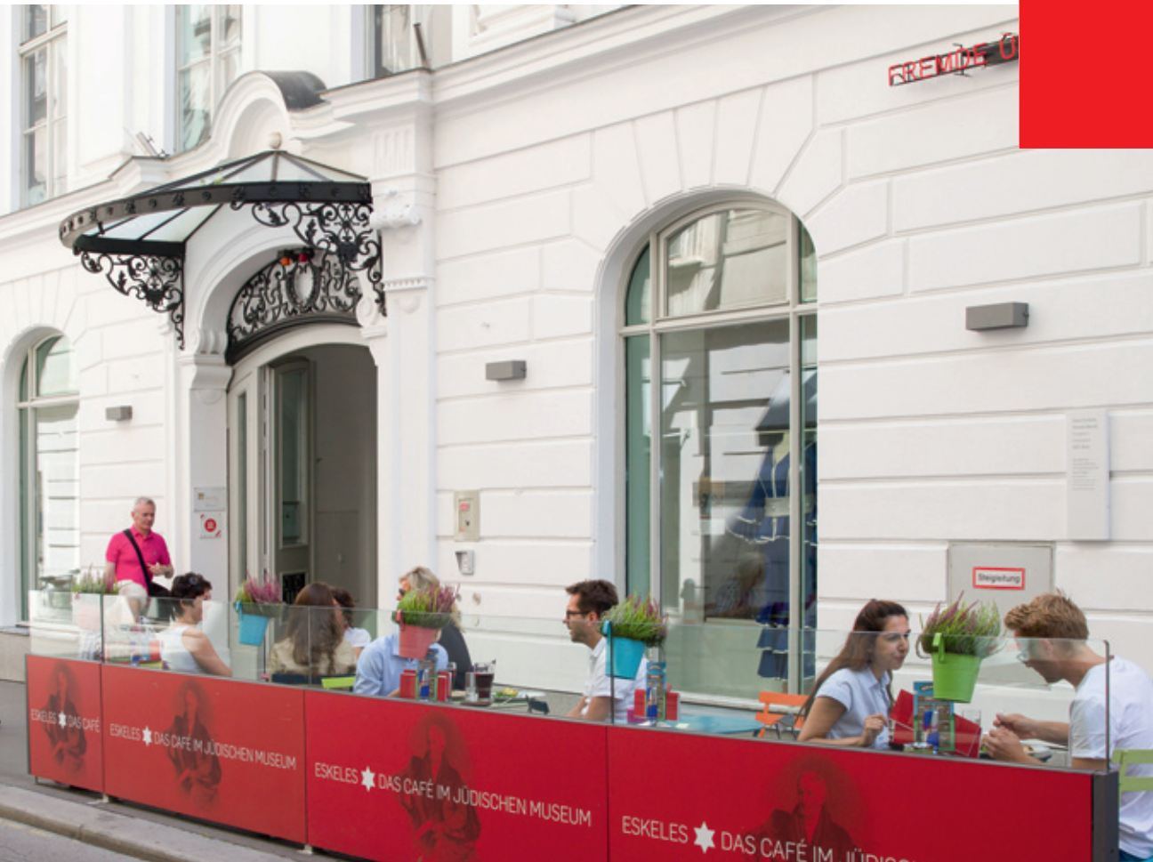
Jewish Museum Vienna – Palais Eskeles